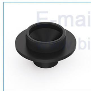
Bowl adapter 50ml tube