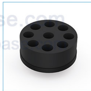
Tray type adapter 9*50ml Centrifuge tube