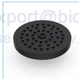
Flat type adapter 500ml or 250ml beaker