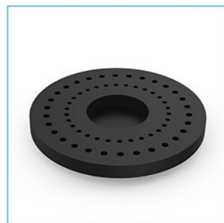
60 micro tube plate 0.5ml micro tube*30, 1.5ml micro tube*30