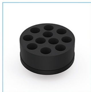
Tray type adapter 11*50ml Centrifuge tube